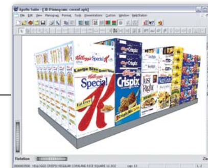
Enhanced 3D capabilities